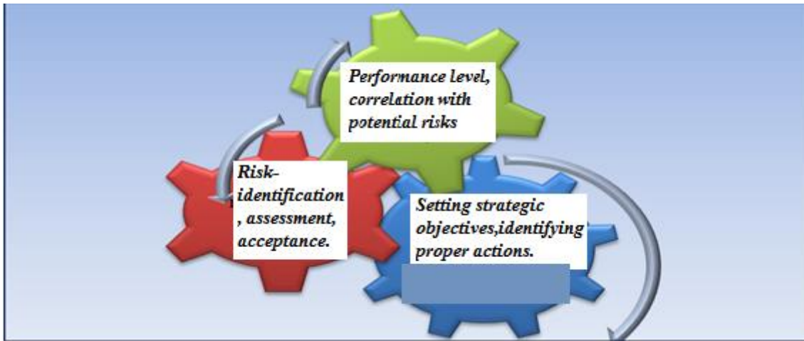
Figure 2 The mechanism of correlating risks with the level of performance established through strategic objectives at the company level