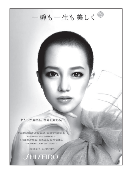
Figure 2: Shiseidō, "This moment. This life. Beautifully" campaign, 2010