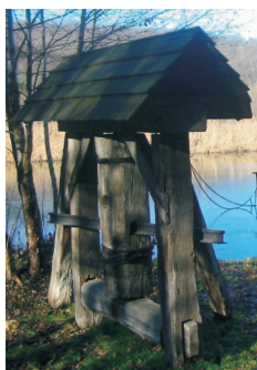
System of cable anchoring („capra”)

The ferry proper is made up of two long boats with flat bottoms that are linked together by a frame of girders covered by beams, which forms the loading platform. Two sloping gangways that rest on two wooden wheels make the connection between the ferry and the shore. The ferry is carried by the water current but is secured by a chain and pulley to a metallic cable over the river along which the ferry moves to the opposite shore.