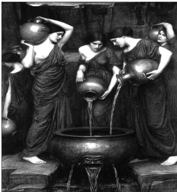
John William Waterhouse (1849-1917), The Danaides