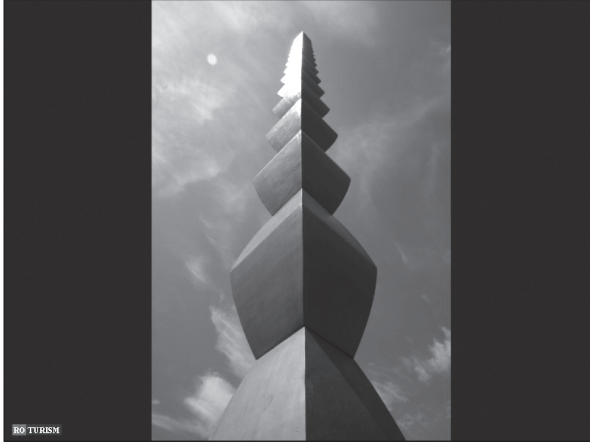
Constantin Brâncuși (1876-1957): Endless Column