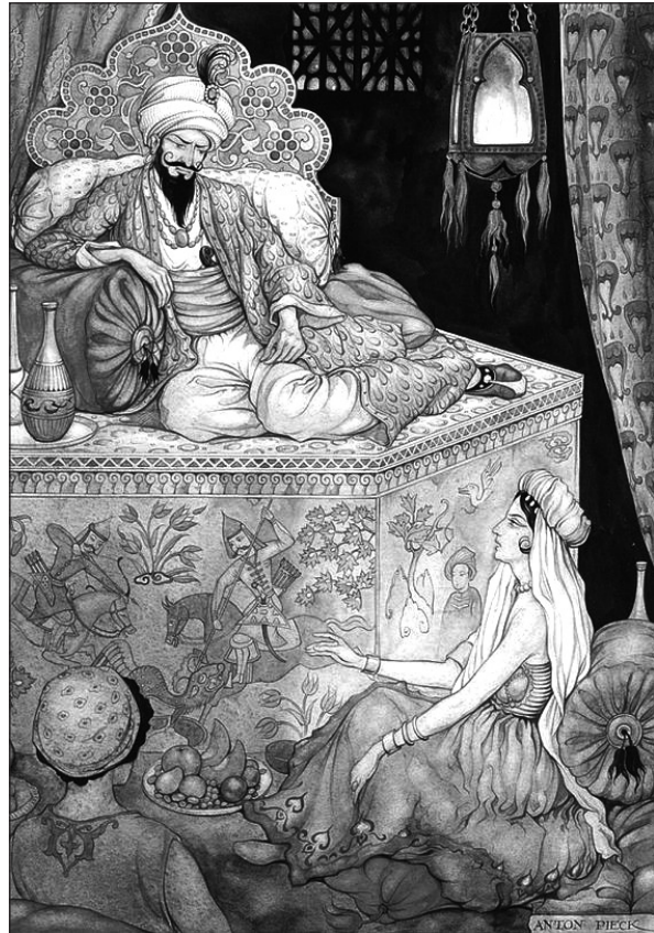
Anton Pieck (1895-1987), 1001 Arabian Nights

Shahryar can’t get enough of beheading each virgin, night after night, and his action simply seems endless. His desires are definitely insatiable, never-ending, as a consequence of the frustration and anger felt due to his wife’s action. Nevertheless, upon this endlessness is also