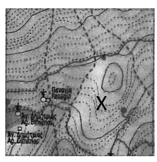
Paliopyrgos(X) on the Land of Megistis Lavra Monastery.

the monasteries led by a central legislative structure comprising the abbots of the twenty monasteries and an executive one. The historic facts have to be taken into account in the organization and evolution of the system: the Byzantine, then the Ottoman domination, the role played by the Genovese in the sea trade, the domination of the Crusaders and, most of all, the danger represented by the outlaw pirates. The Athonite community would not have survived for a thousand years without this system that allowed the practice of the communitarian solidarity and without flexible politics.