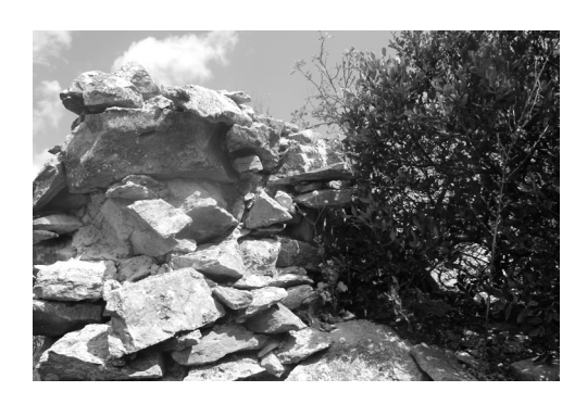
Paliopyrgos from Megistis Lavra, the deserted tower (structure of the wall).

On the west side, there is a starting point from a large monastery, Agios Pavlos (Saint Paul's). There is no other monastery until one reaches the Megiste (Great) Lavra. The seashore is rocky, the current and the winds are strong. The vegetation is poor and the sun shines like in the desert. Although hostile, the region was never empty.